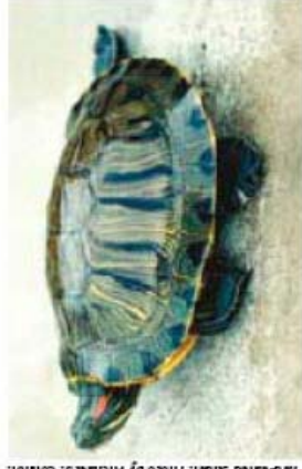
Red-eared Slider.