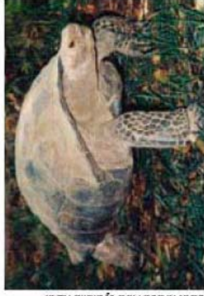
Desert Tortoise.