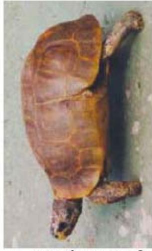
Image: Tortoise.

California Turtle & Tortoise Club is a non-profit 501(c)(3) corporation. Contributions are tax deductible to the full extent of the law.