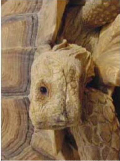
Side of a Tortoise.

California Turtle & Tortoise Club is dedicated to turtle and tortoise preservation, conservation and education.