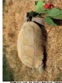
Resting Tortoise.

The California Turtle & Tortoise Club Executive Board coordinates Club-wide activities and prints CTTC publications. The mailing address for the CTTC Executive Board and the Tortuga Gazette Editorial Office is: