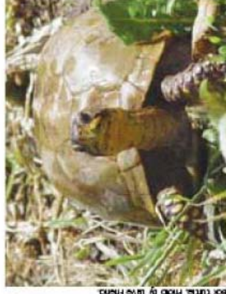
Box Turtle.

Since 1964, Promoting and Facilitating the Care, Rescue and Adoption of Native and Non-native Turtle Species.