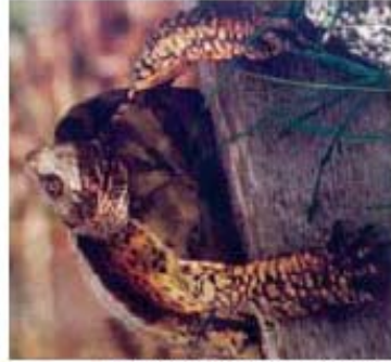
Western Pond turtle.

For CHAPTER USE Date Received _____ Cash/Check/Money Order Chapter Joined _____